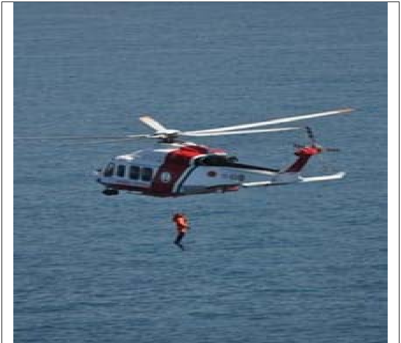
Fig. 1 PASSIM PROJECTS. NEMO 9 ELICOPTER.